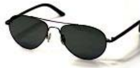
sunglasses 太阳镜 [tài yáng jìng]