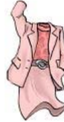
suit 套装 [tào zhuāng]