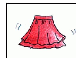
skirt 裙子 [qún zi]