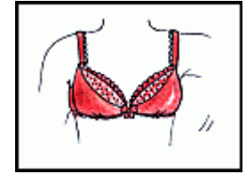
brassiere 胸罩 [xiōng zhào]