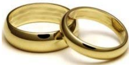
ring 戒指 [jiè zhi]