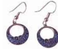
earring 耳环 [ěr huán]