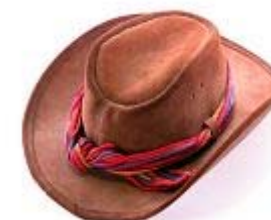
hat 帽子 [mào zi]