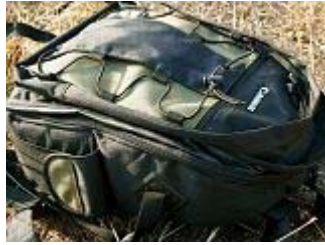
backpack 背包 [bēi bāo]