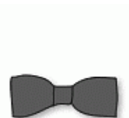
bow tie 領結