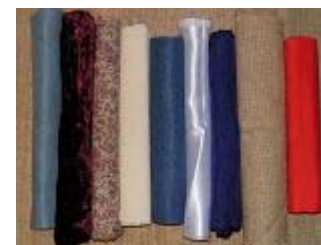
cloth 纺织品 [fǎng zhī pǐn]