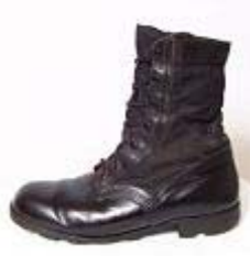
boot 靴子 [xuē zi]