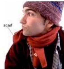
scarf 围巾 [wéi jīn]