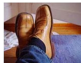
shoe 鞋 [xié]