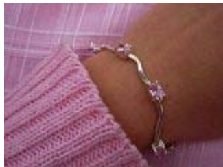
watchband 表带 [biǎo dài]