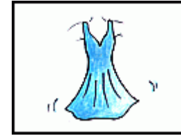
dress 连衣裙 [lián yī qún]