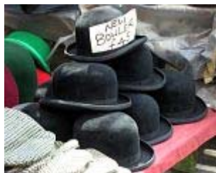
bowler hat 圓頂硬禮帽