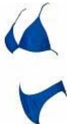
swimsuit 泳衣 [yǒng yī]