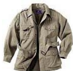
clothes 衣服 [yī fu]