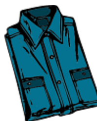
shirt 衬衫 [chèn shān]