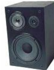
loudspeaker 扬声器 [yáng shēng qì]