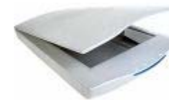
scanner 扫描仪 [sǎo miáo yī]