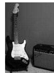
amplifier 放大器 [fàng dà qì]