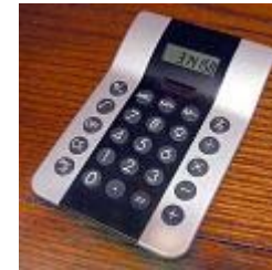
calculator 计算器 [jì suàn qì]