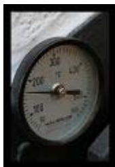
indicator 指示器 [zhǐ shì qì]