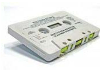
magnetic tape 磁带