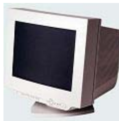
monitor 显示器 [xiǎn shì qì]