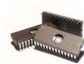
integrated circuit 集成电路 [jí chéng diàn lù]