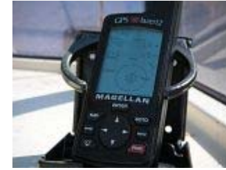
Global Positioning System 全球定位系统