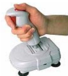
joystick 控制杆 [kòng zhì gǎn]