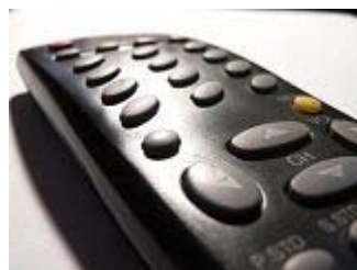
remote control 遥控 [yáo kòng]