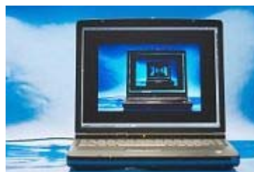
recursion 递归 [dì guī]