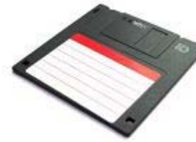
diskette 软盘 [ruǎn pán]