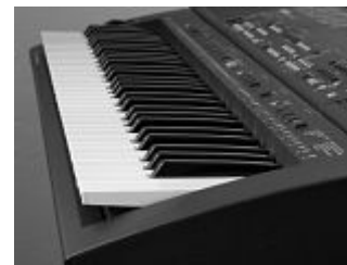
keyboard 键盘 [jiàn pán]