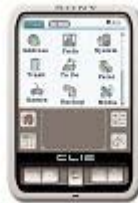
personal digital assistant 个人数字助理