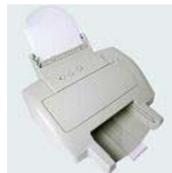
printer 打印机 [dǎ yìn jī]