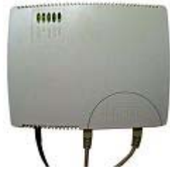
modem 调制解调器 [tiáo zhì jiě diào qì]

All dictionaries Universal dictionary English dictionary Basic vocabulary Vocabulary trainer Picture dictionary English grammar Topical dictionary Flashcards