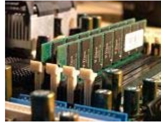
random-access memory 随机存取存储器