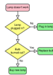
flow chart 流程图