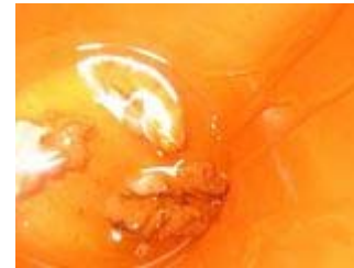
honey 蜂蜜 [fēng mì]