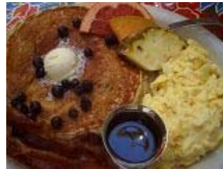
breakfast 早餐 [zǎo cān]