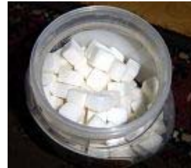
sugar 糖 [táng]