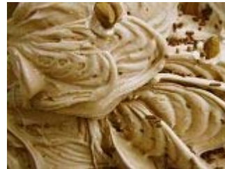
ice cream 冰淇淋 [bīng qí lín]