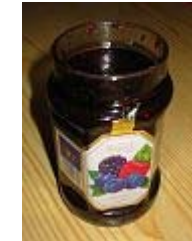
jam 果酱 [guǒ jiàng]