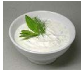
yogurt 酸奶 [suān nǎi]