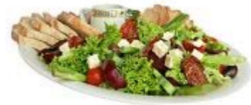
salad 沙拉 [shā lā]