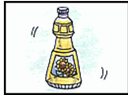
oil 油 [yóu]