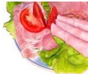
ham 火腿 [huǒ tuǐ]