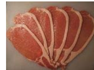
bacon 熏肉 [xūn ròu]