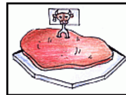
beef 牛肉 [niú ròu]