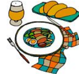
lunch 午饭 [wǔ fàn]