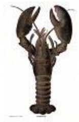
lobster 龙虾 [lóng xiā]