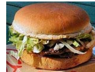
hamburger 汉堡包 [hàn bǎo bāo]