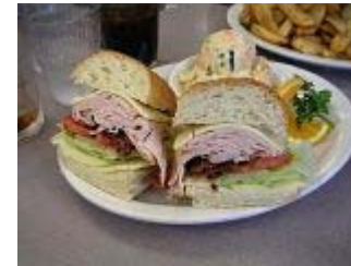
sandwich 三明治 [sān míng zhì]