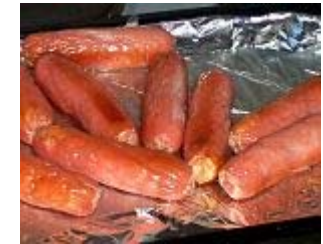
sausage 香肠 [xiāng cháng]