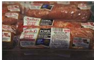
pork 猪肉 [zhū ròu]