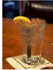
drink 饮料 [yǐn liào]