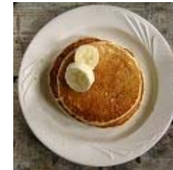
pancake 薄烤饼 [bó kǎo bǐng]