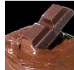
chocolate 巧克力 [qiǎo kè lì]