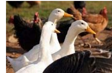
domestic fowl 家禽 [jiā qín]