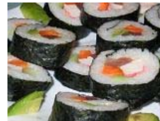
sushi 寿司 [shòu sī]