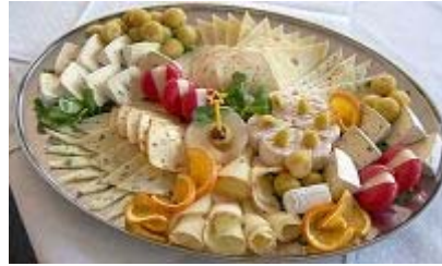
cheese 奶酪 [nǎi lào]

All dictionaries Universal dictionary English dictionary Basic vocabulary Vocabulary trainer Picture dictionary English grammar Topical dictionary Flashcards