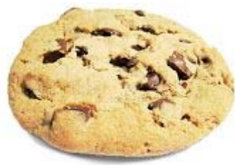
cookie 饼干 [bǐng gān]