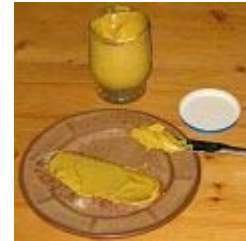
mustard 芥末 [jiè mò]