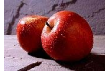
fruit 水果 [shuǐ guǒ]