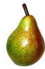
pear 梨子 [lí zi]