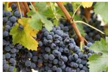
grape 葡萄 [pú tao]