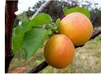
apricot 杏 [xìng]