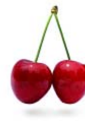
cherry 樱桃 [yīng táo]