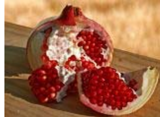
pomegranate 石榴 [shí liú]