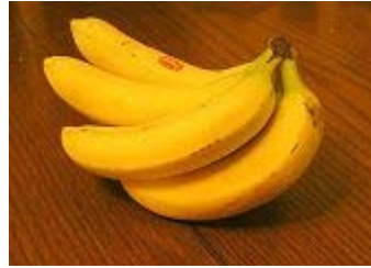
banana 香蕉 [xiāng jiāo]