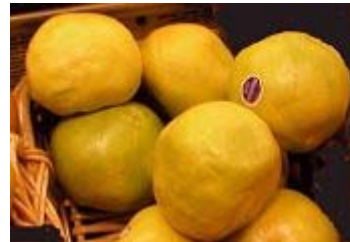
grapefruit 葡萄柚 [pú táo yòu]