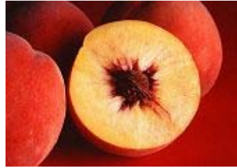
peach 桃子 [táo zi]

All dictionaries Universal dictionary English dictionary Basic vocabulary Vocabulary trainer Picture dictionary English grammar Topical dictionary Flashcards