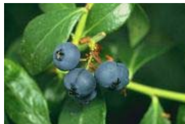
blueberry 蓝莓(lán méi)