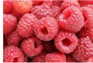
raspberry 树莓 [shù méi]