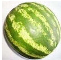
watermelon 西瓜 [xī guā]