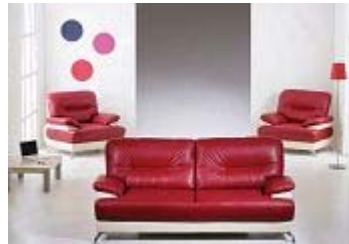
sofa 沙发 [shā fā]