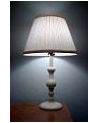
lamp 灯 [dēng]