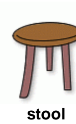
stool 凳子 [dèng zi]