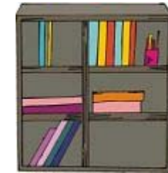
bookcase 书架 [shū jià]