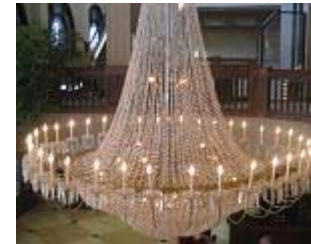
chandelier 吊灯 [diào dēng]