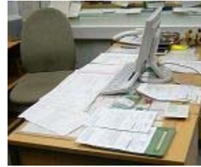
desk 书桌 [shū zhuō]