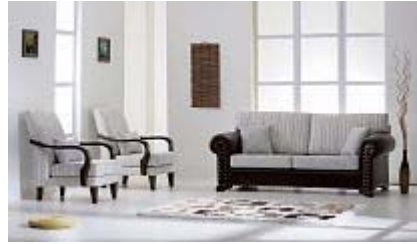
furniture 家具 [jiā jù]

All dictionaries Universal dictionary English dictionary Basic vocabulary Vocabulary trainer Picture dictionary English grammar Topical dictionary Flashcards