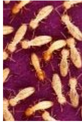
termite 白蚁 [bái yǐ]

All dictionaries Universal dictionary English dictionary Basic vocabulary Vocabulary trainer Picture dictionary English grammar Topical dictionary Flashcards