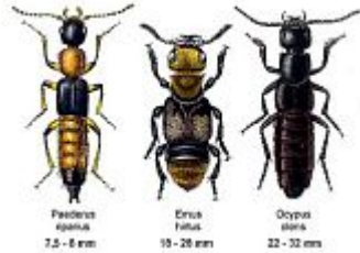
rove beetle 隱翅蟲