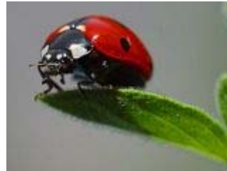
ladybug 瓢虫 [piáo chóng]