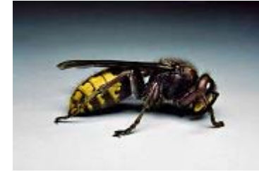
hornet 大黄蜂 [dà huáng fēng]