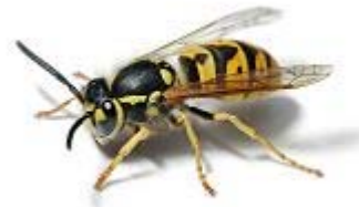
wasp 黄蜂 [huáng fēng]