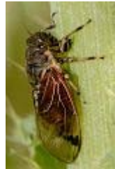
cicada 蝉 [chán]