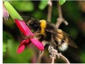
bumblebee 熊蜂 [xióng fēng]