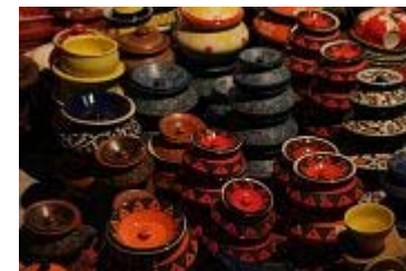
pottery 陶器 [táo qì]