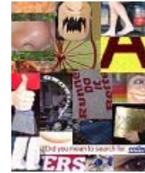
collage 拼贴画 [pīn tiē huà]