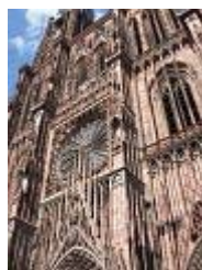
facade 正面 [zhèng miàn]