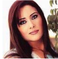
beauty 美 [měi]