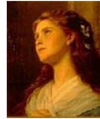
portrayal 肖像 [xiào xiàng]