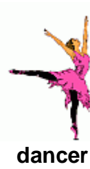
dancer 舞者 [wǔ zhě]