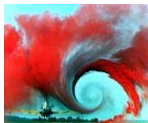
whirl 漩涡 [xuán wō]