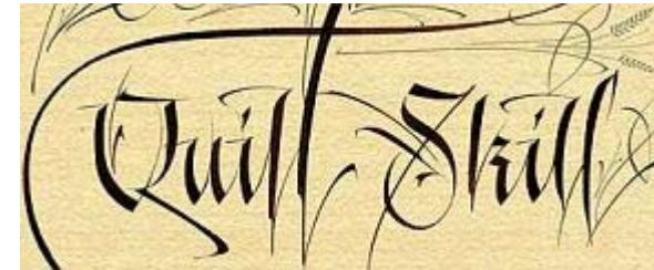
calligraphy 书法 [shū fǎ]