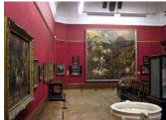
gallery 画廊 [huà láng]