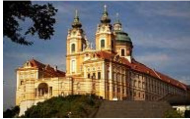
baroque 巴洛克艺术 [bā luò kè yì shù]