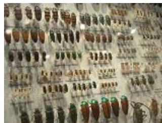
collection 收集 [shōu jí]