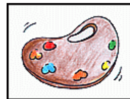
palette 调色板 [tiáo sè bǎn]