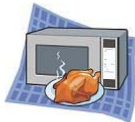
oven 炉子 [lú zi]