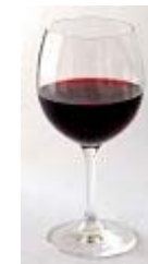
glass 杯子 [bēi zi]