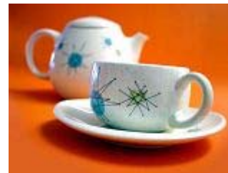
cup 茶杯 [chá bēi]