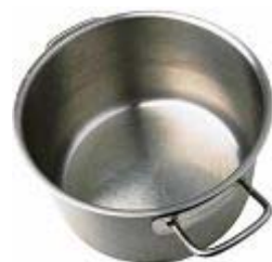
pot 罐 [guàn]