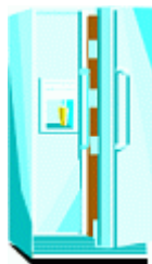
refrigerator 冰箱 [bīng xiāng]