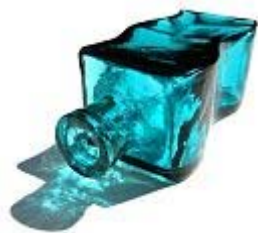
bottle 瓶子 [píng zi]