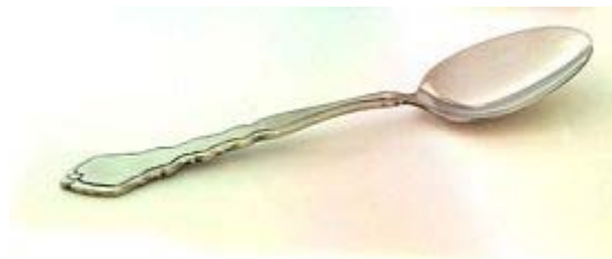
spoon 勺子 [sháo zi]

All dictionaries Universal dictionary English dictionary Basic vocabulary Vocabulary trainer Picture dictionary English grammar Topical dictionary Flashcards