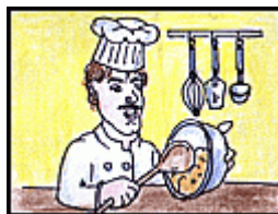
cook 厨师 [chú shī]