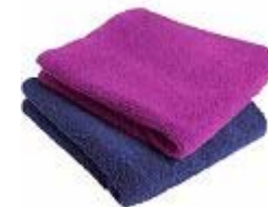
towel 毛巾 [máo jīn]