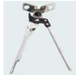
can opener 开罐器