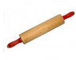
rolling pin 擀面杖