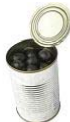
can 罐头 [guàn tou]