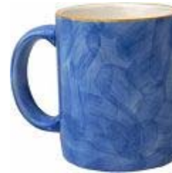
mug 杯子 [bēi zi]