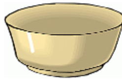
bowl 碗 [wǎn]