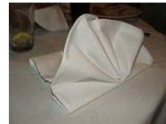
napkin 餐巾 [cān jīn]