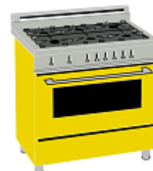
stove 炉子 [lú zi]