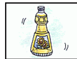
oil 油 [yóu]