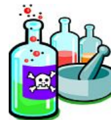
poison 毒药 [dú yào]