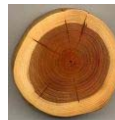
wood 木头 [mù tou]