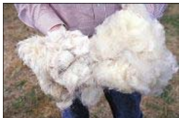
wool 羊毛 [yáng máo]