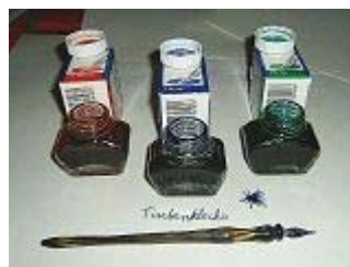
ink 墨水 [mò shuǐ]