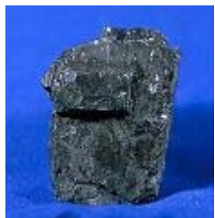
coal 煤 [méi]

All dictionaries Universal dictionary English dictionary Basic vocabulary Vocabulary trainer Picture dictionary English grammar Topical dictionary Flashcards