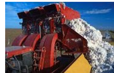
cotton 棉花 [mián huā]