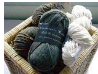
thread 线 [xiàn]