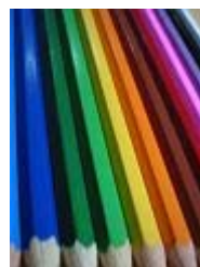
color 颜色 [yán sè]