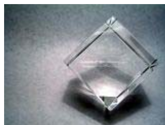
crystal 水晶 [shuǐ jīng]