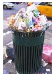
waste 垃圾 [lā jī]