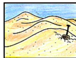
sand 沙 [shā]