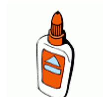
glue 胶水 [jiāo shuǐ]