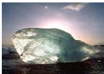
ice 冰 [bīng]