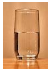
water 水 [shuǐ]