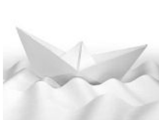
paper 纸 [zhǐ]