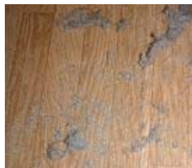
dust 灰尘 [huī chén]