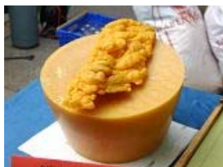
wax 蜡 [là]