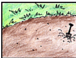
ground 土壤 [tǔ rǎng]