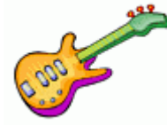
electric guitar 电吉他