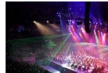
concert 音乐会 [yīn yuè huì]