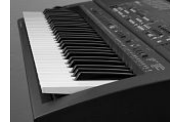
keyboard 键盘 [jiàn pán]