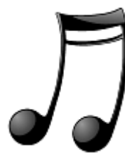
note 音符 [yīn fú]