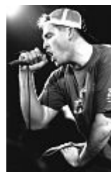
singer 歌手 [gē shǒu]