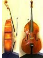
bass fiddle 低音提琴