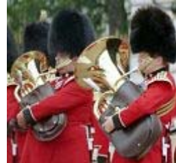
bass horn 大号