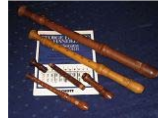
fipple flute 直笛