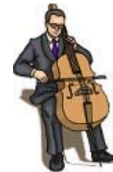
musician 音乐家 [yīn yuè jiā]