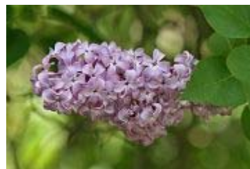
lilac 紫丁香 [zǐ dīng xiāng]