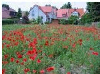
poppy 罂粟 [yīng sù]

All dictionaries Universal dictionary English dictionary Basic vocabulary Vocabulary trainer Picture dictionary English grammar Topical dictionary Flashcards