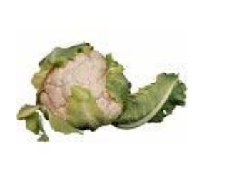
cauliflower 花椰菜 [huā yē cài]