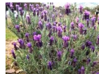
lavender 薰衣草 [xūn yī cǎo]