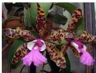
orchid 兰花 [lán huā]