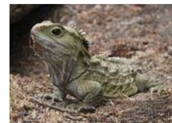
reptile 爬行动物 [pá xíng dòng wù]