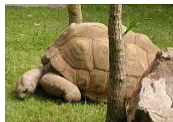
tortoise 乌龟 [wū guī]