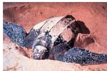
leatherback turtle 棱皮龜