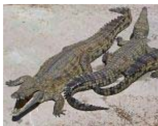
crocodile 鳄鱼 [è yú]