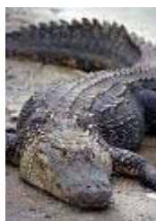
alligator 短吻鳄 [duǎn wěn è]