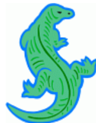
Komodo dragon 科莫多巨蜥