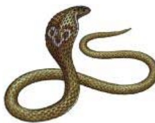
cobra 眼镜蛇 [yǎn jìng shé]