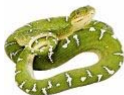
snake 蛇 [shé]