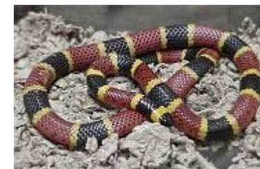
coral snake 珊瑚蛇