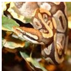
python 蟒科 [mǎng kē]

All dictionaries Universal dictionary English dictionary Basic vocabulary Vocabulary trainer Picture dictionary English grammar Topical dictionary Flashcards