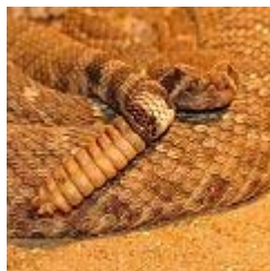
rattlesnake 响尾蛇 [xiǎng wěi shé]