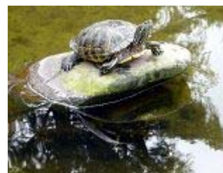
turtle 海龟 [hǎi guī]