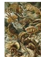
lizard 蜥蜴 [xī yì]