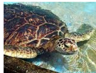
sea turtle 海龟 [hǎi guī]