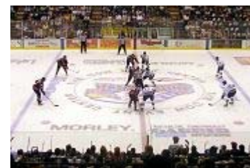
ice hockey 曲棍球