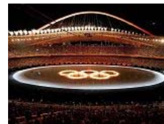
Olympic Games 奥林匹克运动会