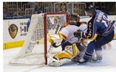
goal 球门 [qiú mén]