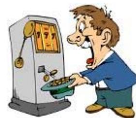
win 赢 [yíng]