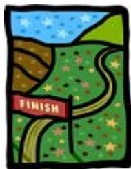
finish 目的地 [mù dì dì]