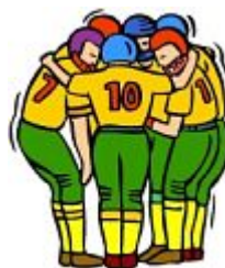
team 团队 [tuán duì]