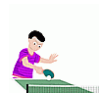
table tennis 乒乓球