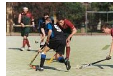
field hockey 曲棍球