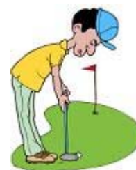
golf 高尔夫球 [gāo ěr fū qiú]