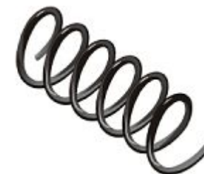
spring 弹簧 [tán huáng]