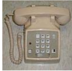
telephone 电话 [diàn huà]