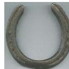
horseshoe 马蹄铁 [mǎ tí tiě]