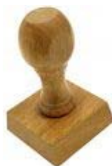
stamp 印章 [yìn zhāng]