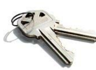
key 钥匙 [yào shi]