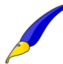
pen 钢笔 [gāng bǐ]