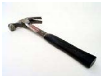
hammer 锤子 [chuí zi]