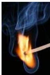
match 火柴 [huǒ chái]

All dictionaries Universal dictionary English dictionary Basic vocabulary Vocabulary trainer Picture dictionary English grammar Topical dictionary Flashcards