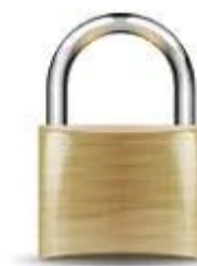
lock 锁 [suǒ]