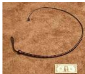
whip 鞭子 [biān zi]