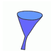
funnel 漏斗 [lòu dòu]