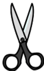
scissors 剪刀 [jiǎn dāo]