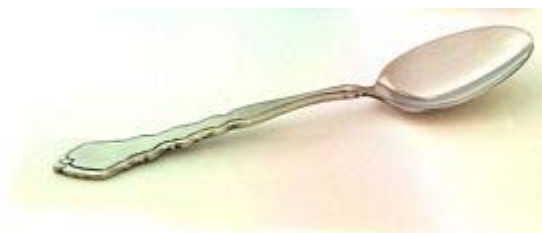
spoon 勺子 [sháo zi]