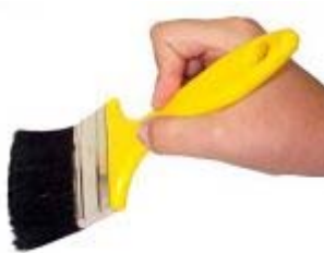
brush 刷子 [shuā zi]