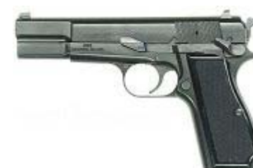
gun 炮 [páo]