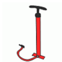
pump 泵 [bèng]