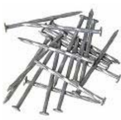
nail 钉 [dīng]