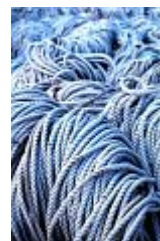
rope 绳子 [shéng zi]