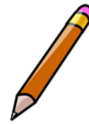
pencil 铅笔 [qiān bǐ]