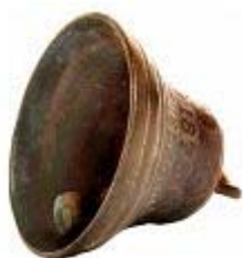
bell 钟 [zhōng]