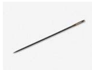
needle 针 [zhēn]