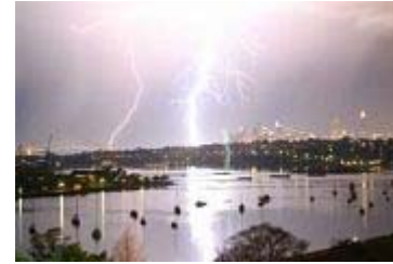
storm 暴风雨 [bào fēng yǔ]