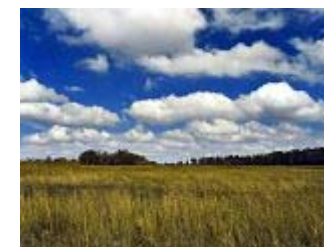
weather 天气 [tiān qì]