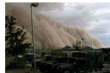
dust storm 沙尘暴