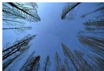
sky 天空 [tiān kōng]