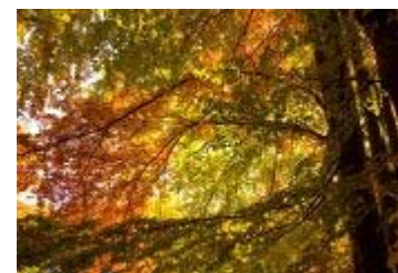
autumn 秋天 [qiū tiān]