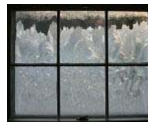
frost 霜 [shuāng]