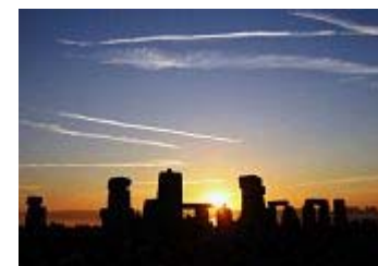
sunrise 日出 [rì chū]