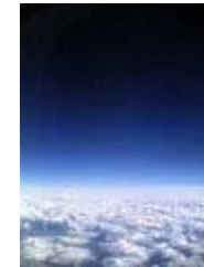
atmosphere 大气 [dà qì]