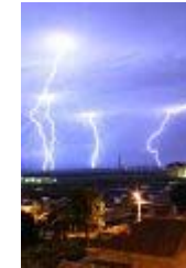
lightning 闪电 [shǎn diàn]