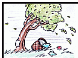
wind 风 [fēng]