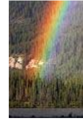
rainbow 彩虹 [cǎi hóng]