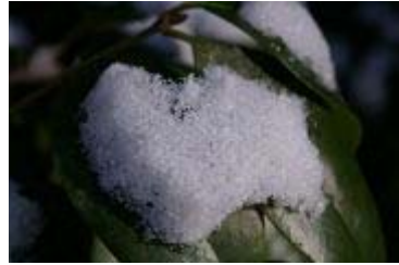
snow 雪 [xuě]

All dictionaries Universal dictionary English dictionary Basic vocabulary Vocabulary trainer Picture dictionary English grammar Topical dictionary Flashcards