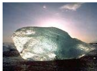
ice 冰 [bīng]